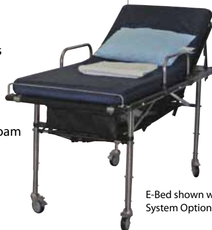
E-Bed shown with System Options